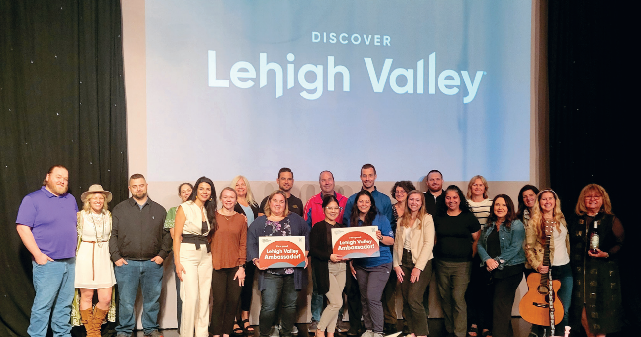
Above: Leadership Lehigh Valley Class of 2024 spending the day at WLVT PBS39; Below: Members of Leadership Pocono on a field trip to a local cranberry bog.